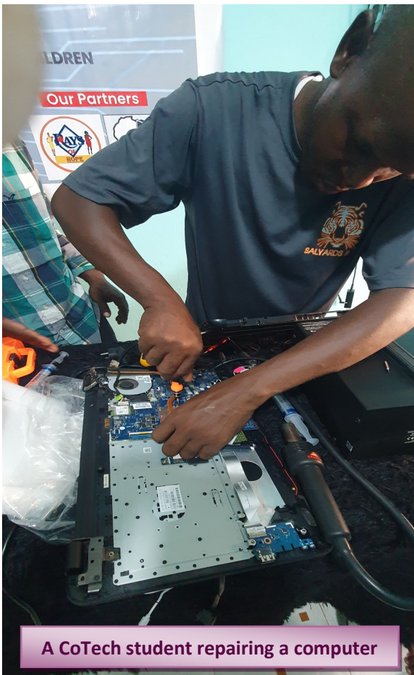
A CoTech student repairing a computer

This past quarter they have taught 520 students, 304 being female and 216 being male. Of this, 506 were learners in three local primary schools they partner with. Six of those students are also taking The Cotech's repair and maintenance of computer hardware course and 8 are doing other Information and Communication Technology (ICT) related courses. Two of their students this past quarter have secured jobs, one who has opened a cyber café in a neighboring town while the other one is employed as a data entry clerk in the local milk processing plant.