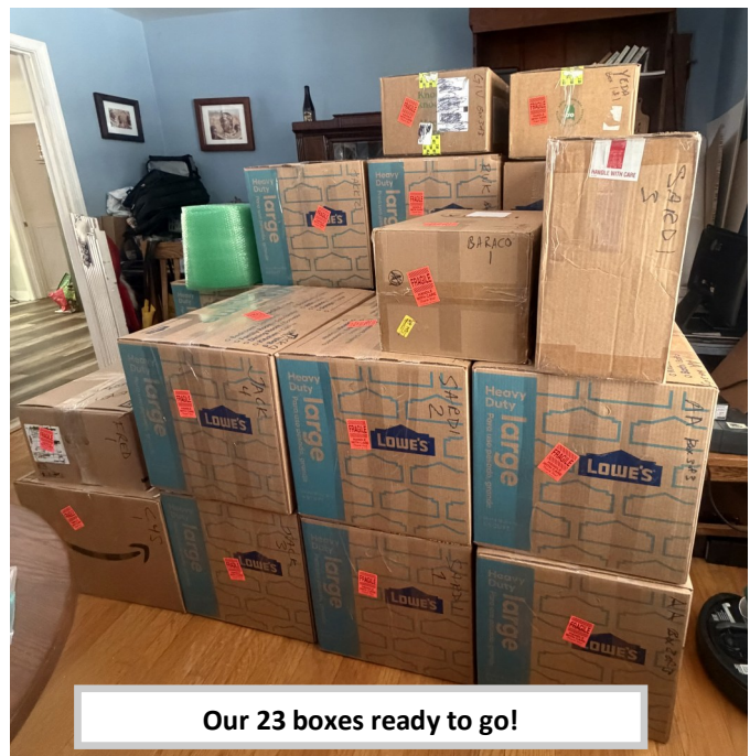
Our 23 boxes ready to go!