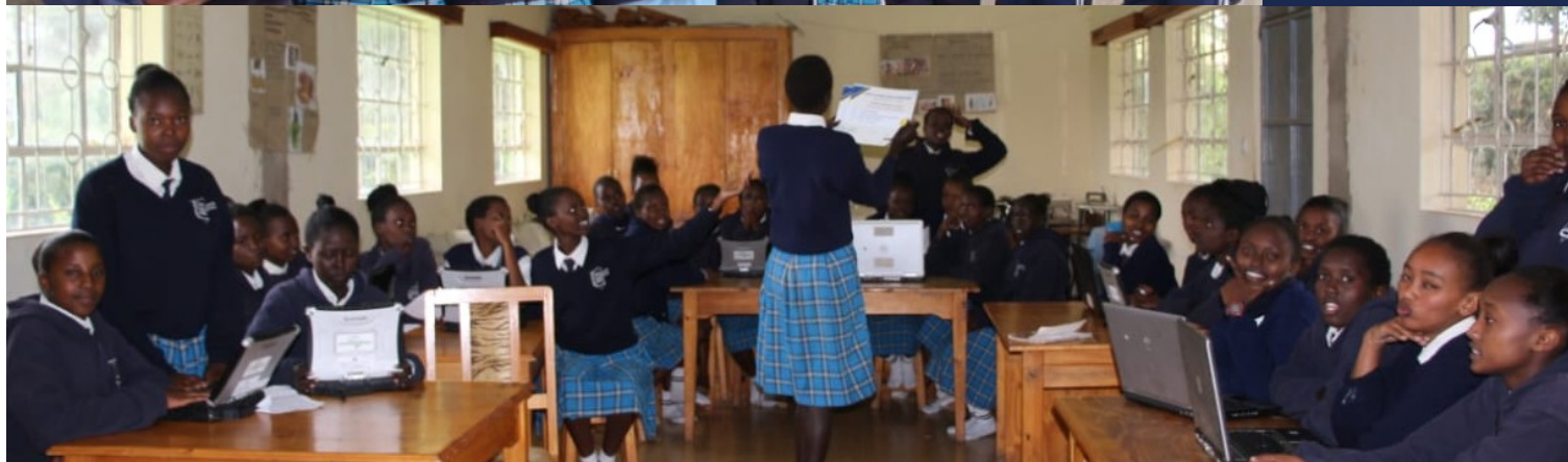
Top photo: student presenters