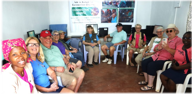
LEFT—Some of our team in the computer lab