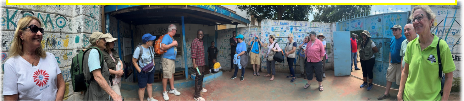
Bottom—our Team with Renice inside the Code with Kids space