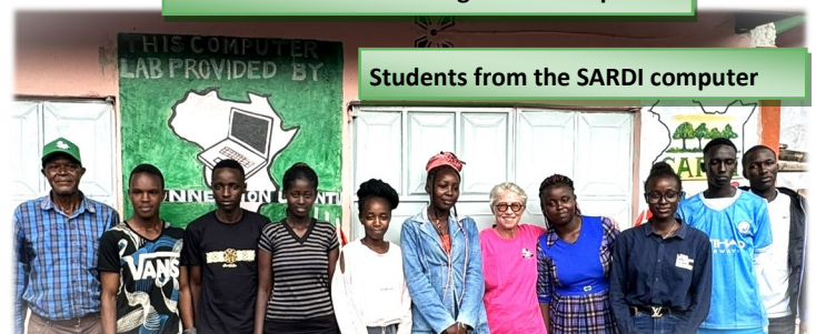
Students from the SARDI computer