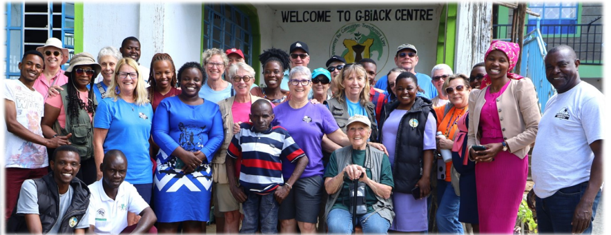
BELOW—Our team with the entire G-BIACK Team