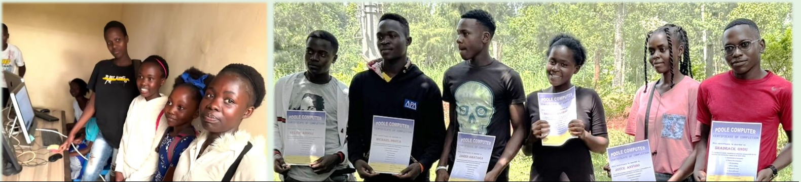
Top—inside the Poole lab

We visited two labs, the Poole lab and the Jiunge (meaning Join) lab, in the Luanda area, both belonging to the Emuhaya Group of Disabled (EGD). We spent the day enjoying time with their students and also with the EGD members and their community. We handed out graduation certificates to several of their students from both labs and really had a great day. They have broken down their students into categories, Beginner, Intermediate and Advanced. Last year they taught 69 students at the Jiunge lab and 70 students at the Poole lab. We were truly blessed to have so much time with them.