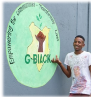
LEFT—The G-BIACK team getting us energized!