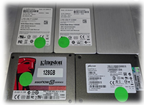
Lot of 5 Mixed Brand Mixed Models 128GB 2.5" Sata SSD: