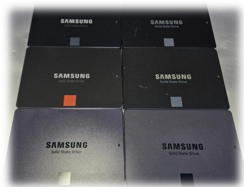
Lot of 6 Samsung Mixed Models 250GB 2.5" Sata SSD: