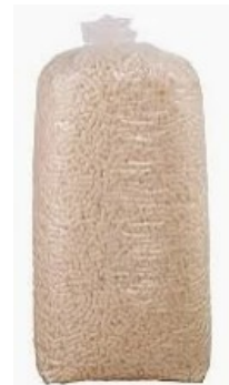
Packing Peanuts Shipping Anti Static Loose Fill 30 Gallons 4 Cubic Feet Pink (We could use three of these):

Thank you so much... Together we change lives!