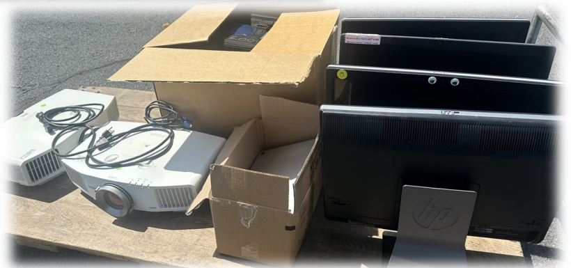
Right: projectors, All in One desktops, computer bags and more laptops