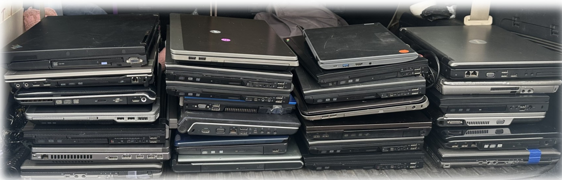
Above: laptops donated from Computer Ministry

When Connection Ubuntu began this work it was quite challenging. We started with donations from the public, donations because the individual had upgraded their computer and were looking for a home for the old device, whether it worked or not. Fast forward to now, having Computer Ministry as our partner has been such a game-changer. These photos show just how much equipment we continually receive from them, whether it's laptops, desktops, or peripherals, they are so very generous in supporting our work. We surely could not do what we do without the kind hearts of the volunteers at Computer Ministry. We have been blessed beyond measure and we are so thankful. We know our African partners are also thankful and grateful. Because of these donations from Computer Ministry and Connection Ubuntu, so many students' futures have been changed together... TOGETHER WE CHANGE LIVES!