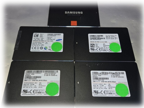
Lot of 5 Samsung Mixed Models 128GB 2.5" Sata SSD: