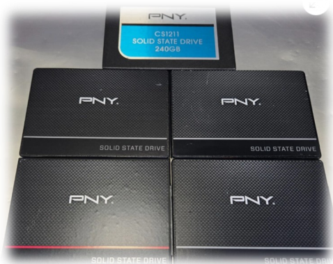
Lot of 5 PNY Mixed Models 240GB 2.5" Sata SSD: