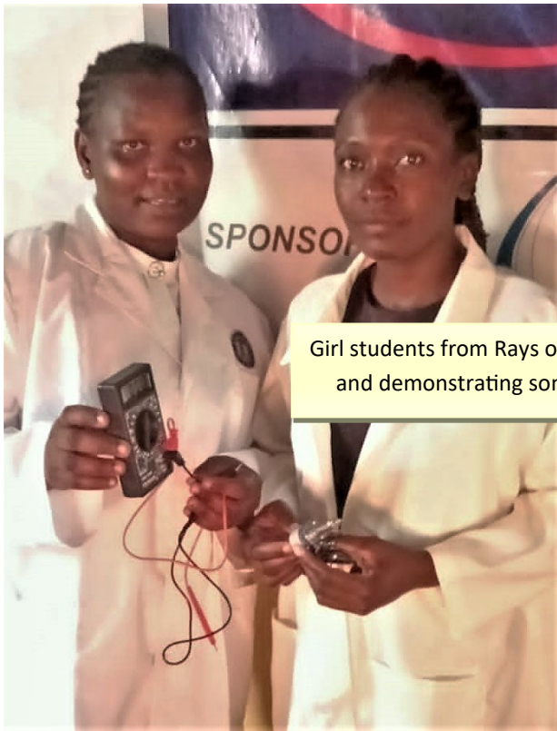
Girl students from Rays of Hope, displaying and demonstrating some of the tools.