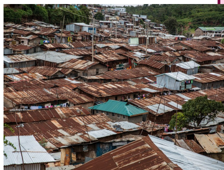
Slums in Kenya